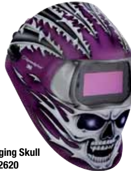
Raging Skull 752620