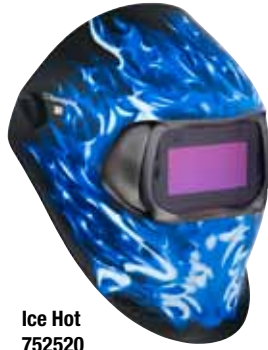
Ice Hot 752520