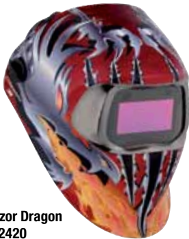
Razor Dragon 752420