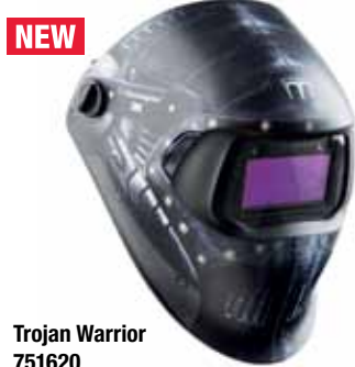
Trojan Warrior 751620