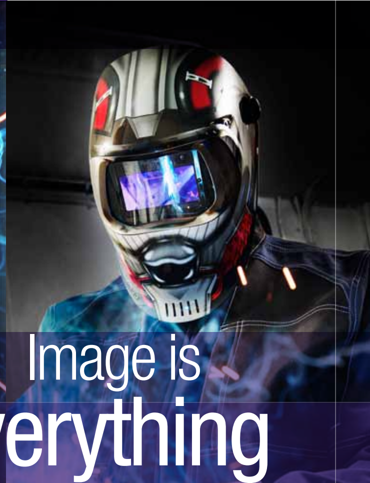
Image is Everything