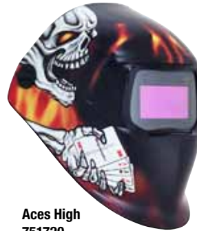
Aces High 751720