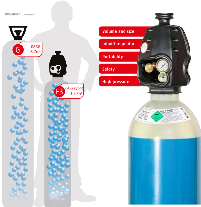
Smaller package. Same gas.

New BOC shielding gases added to the VIPR range.